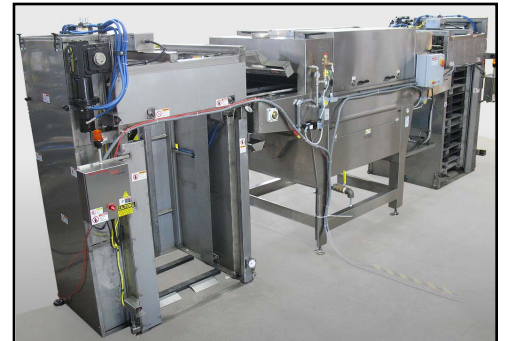
Pallet washer system to assure your customer receives clean, sanitized pallets

Whether you're looking to replace individual machines or conveyor sections, Thiele has the capability to respond quickly. We'll fix individual areas of your empty case room to have you running more efficiently than ever.