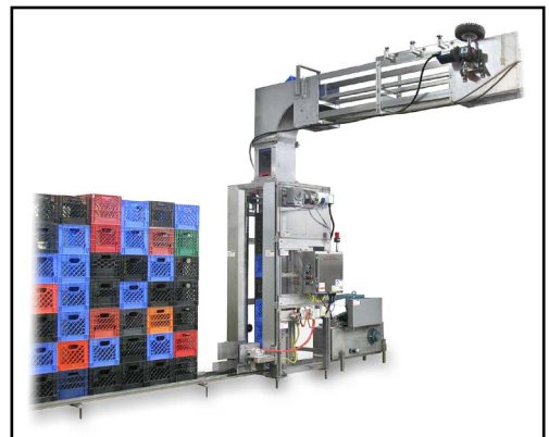
Universal case unstacker for any direction case exit

All sales are subject to our prevailing terms and conditions. Illustrations and specifications are subject to change without notice. Machines shown without guards are for illustrative purposes only. Guards are supplied and must be in place before operation.