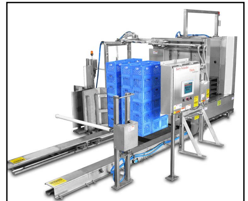
Automatic depalletizer and pallet stacking system